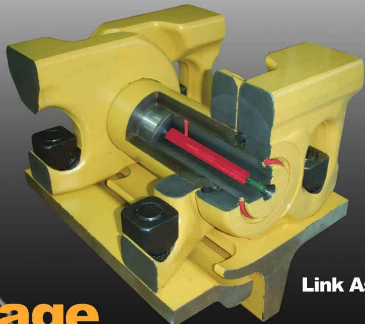
Link Assy (Current)