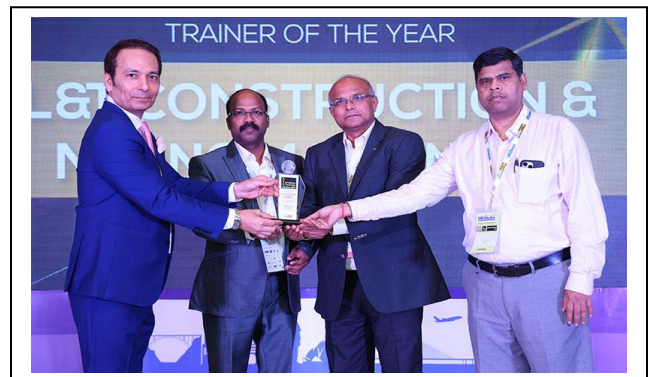
Best Trainer of the Year Award