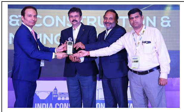
Best Dealer of the Year Award