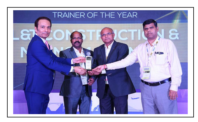
Best Trainer of the Year Award